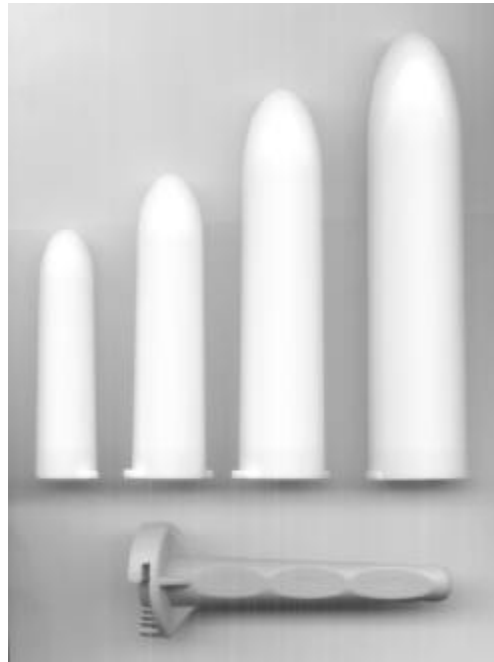
Fig 2 – Amielle Trainers